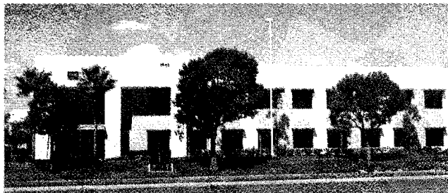
The Goodwill Fitness Center in Santa Ana

To maintain or increase overall health, physical exercise plays an important role – especially for individuals who have a physical disability or chronic illness. In fact, members can help reduce secondary health conditions and complications by engaging in physical activity at least five days a week for 30 minutes or more. A balanced approach to exercise is the safest, most natural form of preventative medicine – and with the right equipment and guidance, anyone can achieve it. Exercise is good for physical