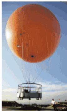
The Great Park Balloon will relaunch Saturday. > SEAN EMERY/STAFF WRITER

The preview park is slated to host a series of summer events, with a variety of concerts and dances held next to a former El Toro hangar converted into a cafe and entertainment venue. It will also feature traditional park amenities