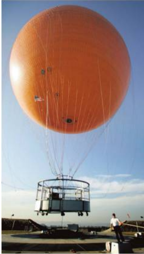
The Great Park Balloon will re-launch Saturday.