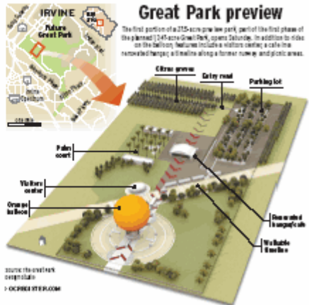
ON THE COVER: The Great Park Balloon